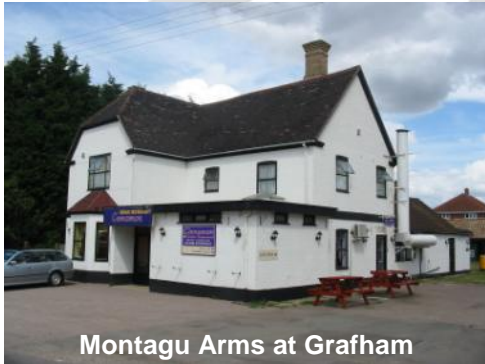
Montagu Arms at Grafham

In August 1988, the St Neots branch of CAMRA held 'double pub socials' at the Black Bull and Dragoon in Brampton, and