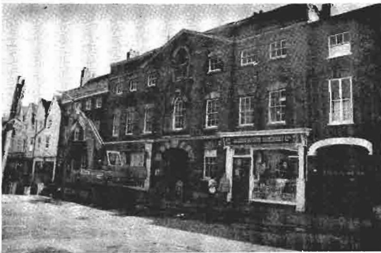
James Paine Brewery Facade