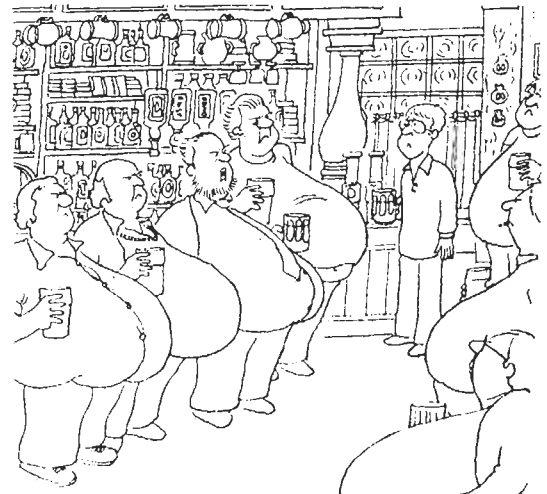
"As you're new to the village there's just one thing you've got to know - we don't like a man who sips his beer!"